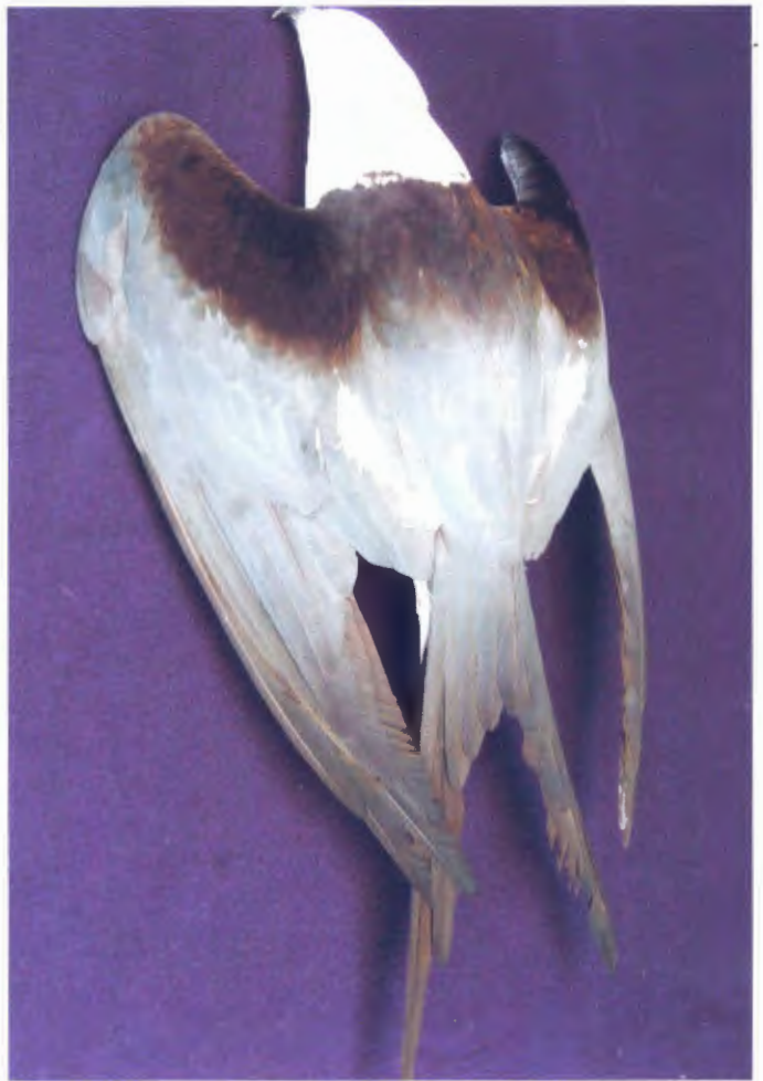
SWALLOW-TAILED KITE 168-01-2005 OTOBARO Creek. LANCASTER, CO 3/13/2005